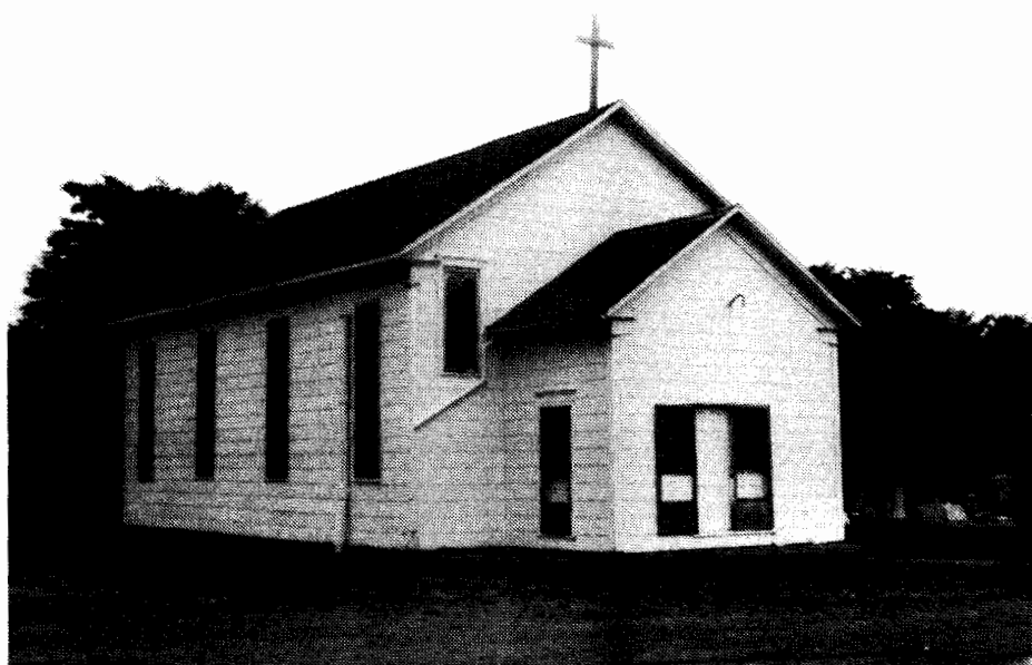
IMMACULATE CONCEPTION CHURCH OZARK, SUNSBURY TOWNSHIP, MONROE COUNTY, OHIO