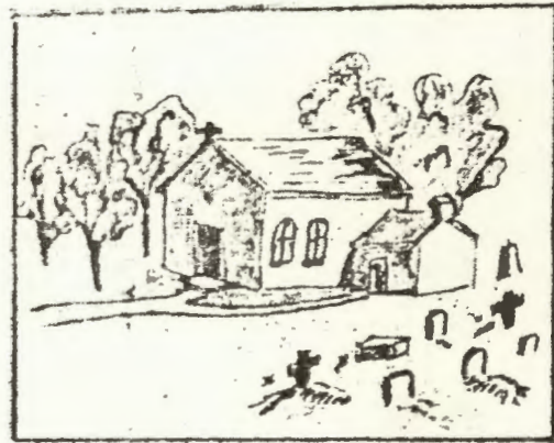
The first St. Mary's Church in Lancaster.